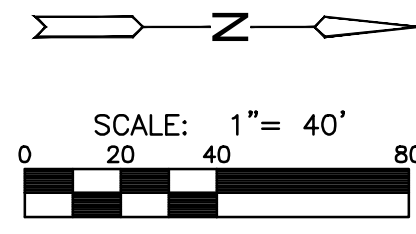
PLAN LINE 10 PROFILE LINE 10

NOTE: CONTRACTOR TO VERIFY LOCATION AND ELEVATION OF EXIST. WATER LINES AND ALL OTHER UTILITIES PRIOR TO CONSTRUCTION.