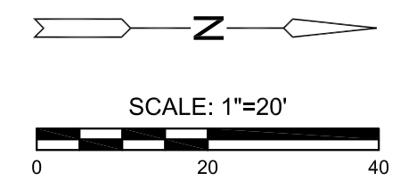
PLAN LINE 3 PROFILE LINE 3

NOTES: CONTRACTOR TO VERIFY LOCATION AND ELEVATION OF EXISTING UTILITES LINE PRIOR TO CONSTRUCTION. PROPOSED ELECTRICAL CONDUIT RUNS AS SHOWN ARE SCHEMATIC IN NATURE. REFERENCE ELECTRICAL SHEETS FOR INSTALLATION DETAILS.