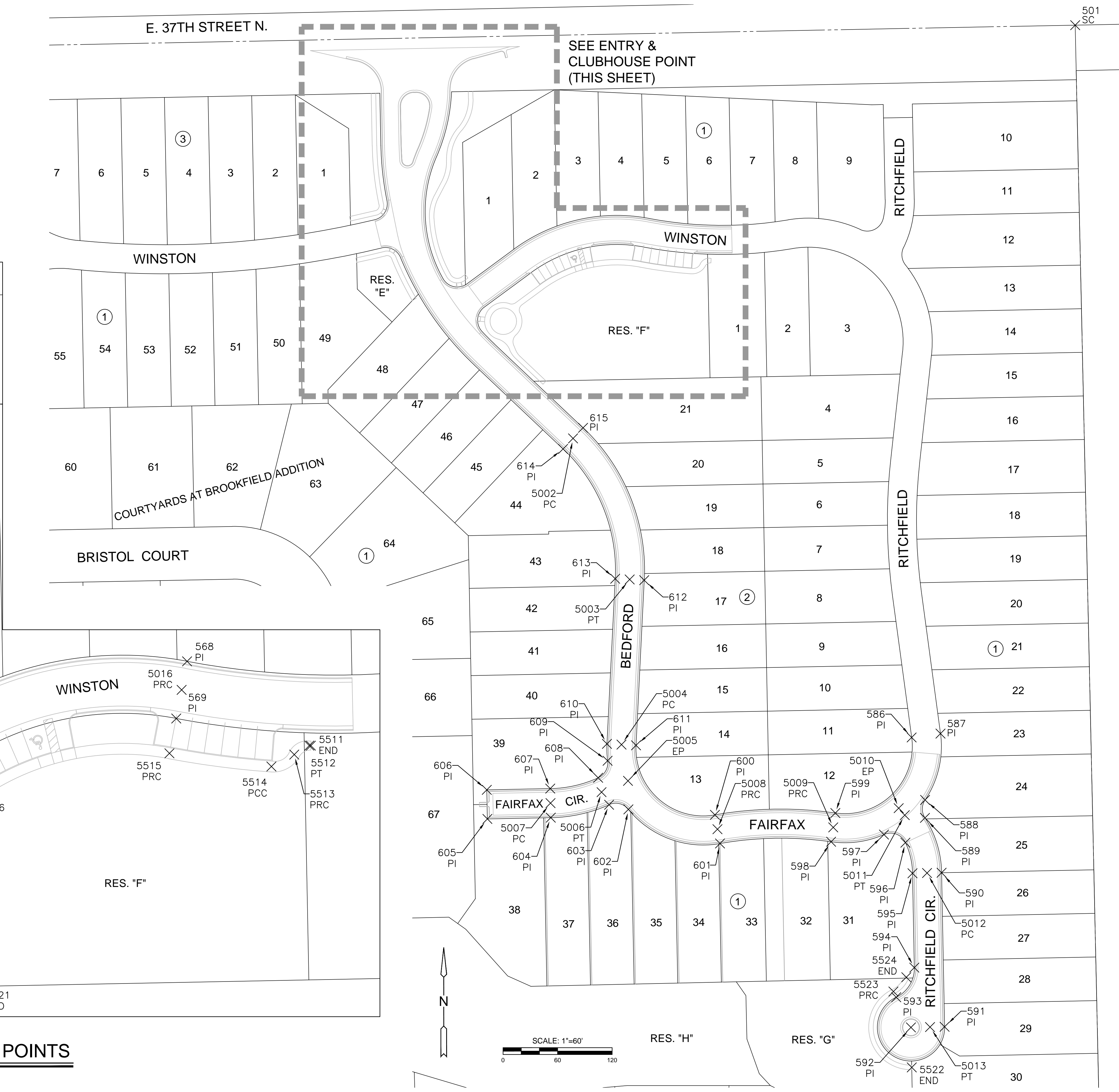
SCALE: 1" = 60'

©2018 MKEC Engineering All Rights Reserved www.mkec.com These drawings and their contents, including, but not limited to, all concepts, designs, & ideas are the exclusive property of MKEC Engineering (MKEC), and may not be used or reproduced in any way without the express consent of MKEC.