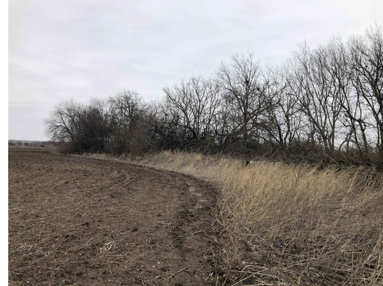
Figure 2 View of Typical Hedge Row to be removed.