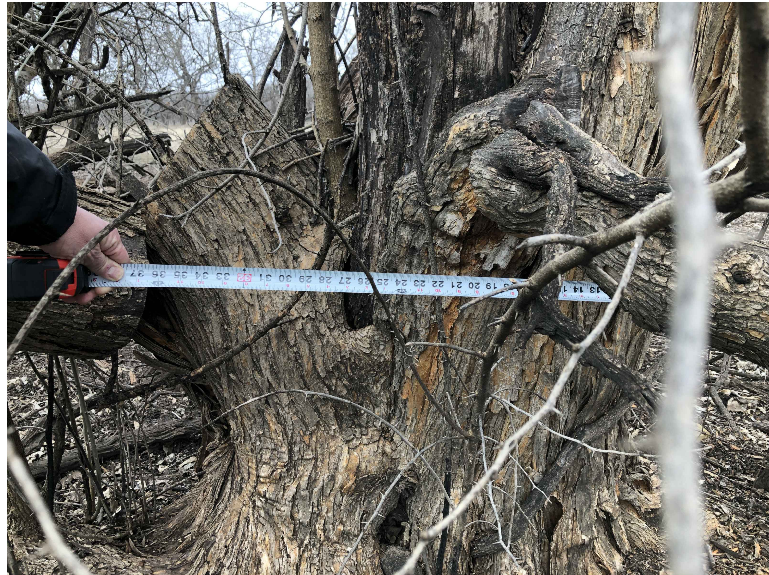
Figure 3 View of Random Tree in Hedge Row