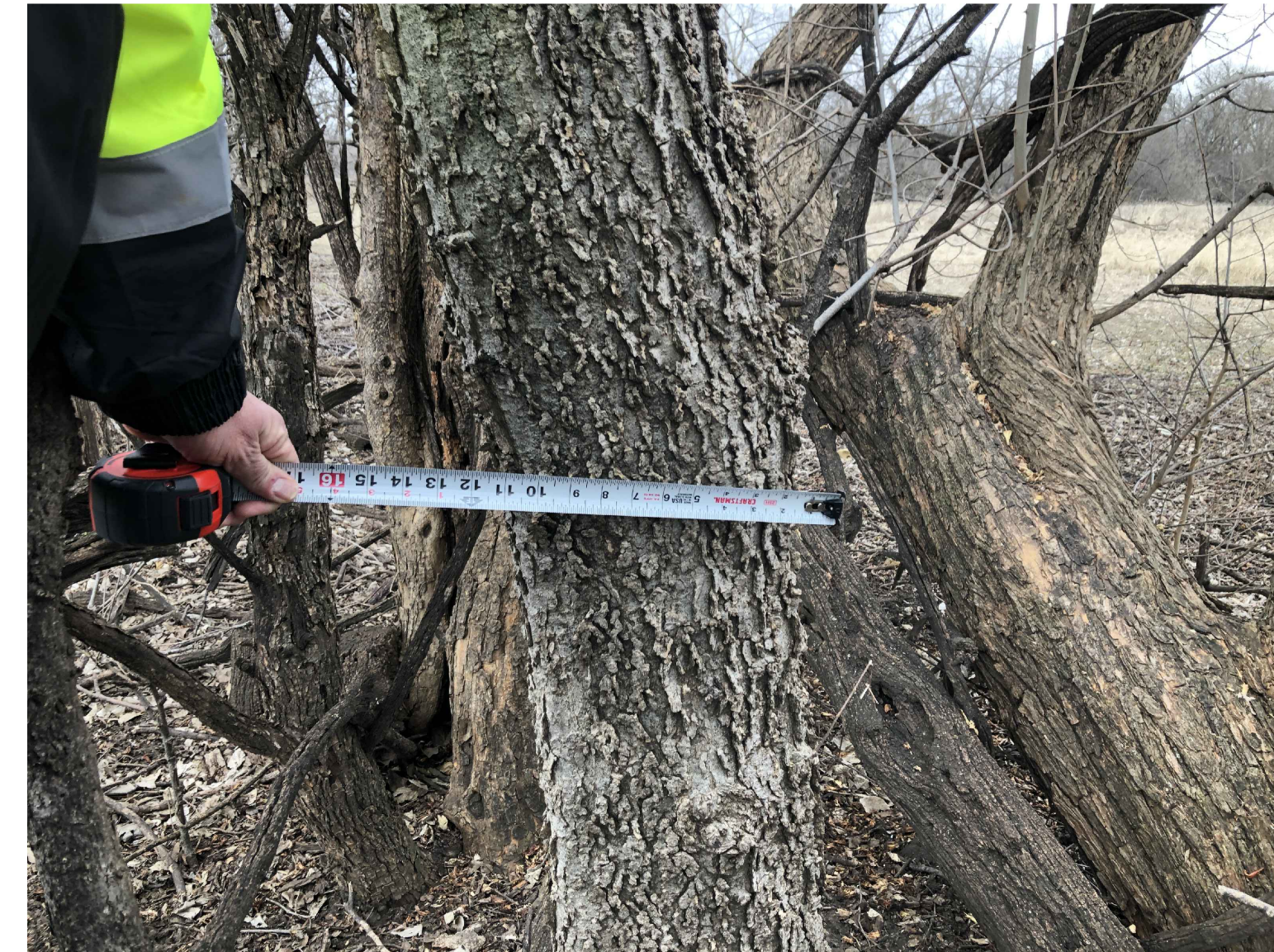
Figure 4 View of Random Tree in Hedge Row

File: L:\2018\18266039 - Cedar Creek Phase 1\Drawings\CD\Drainage\Demolition.dwg, Last Save: 5/20/2019 3:20 PM, Last saved by: CD Jurey Last plotted by: Jurey, Caleb D., Plot Date: 5/20/2019 4:24 PM, Plotter used: None