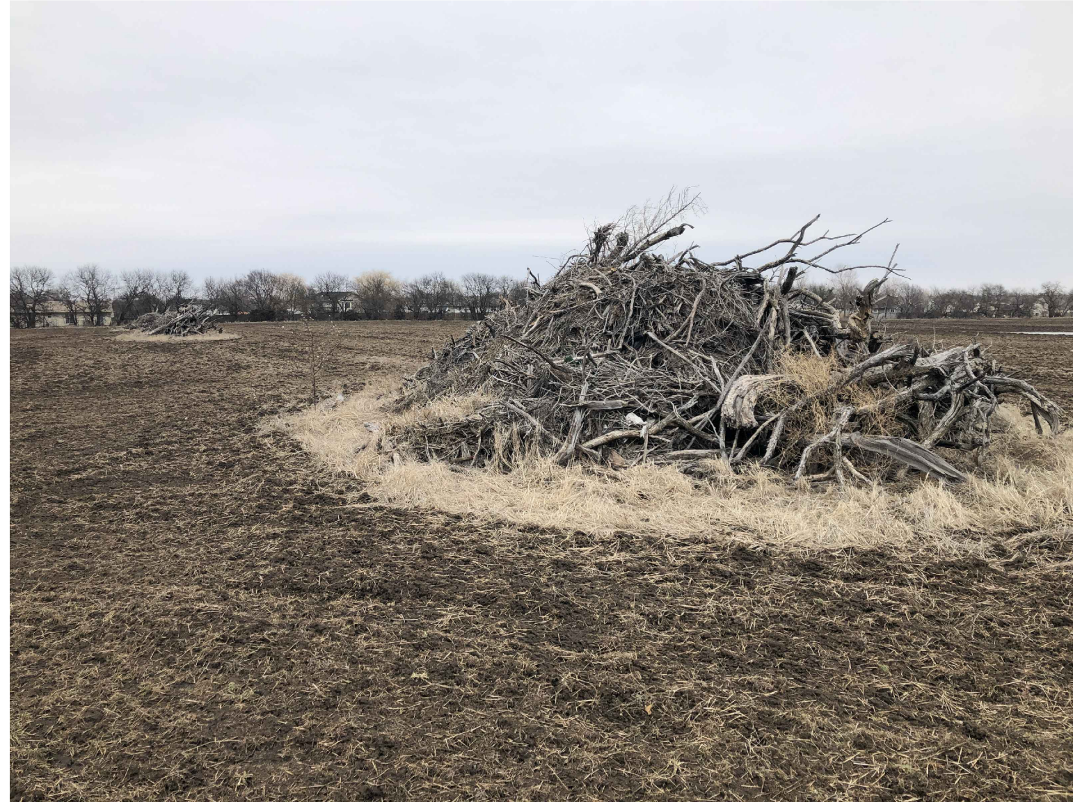
Figure 1 Typical Debris Pile Approximately 14 piles are located on the site.