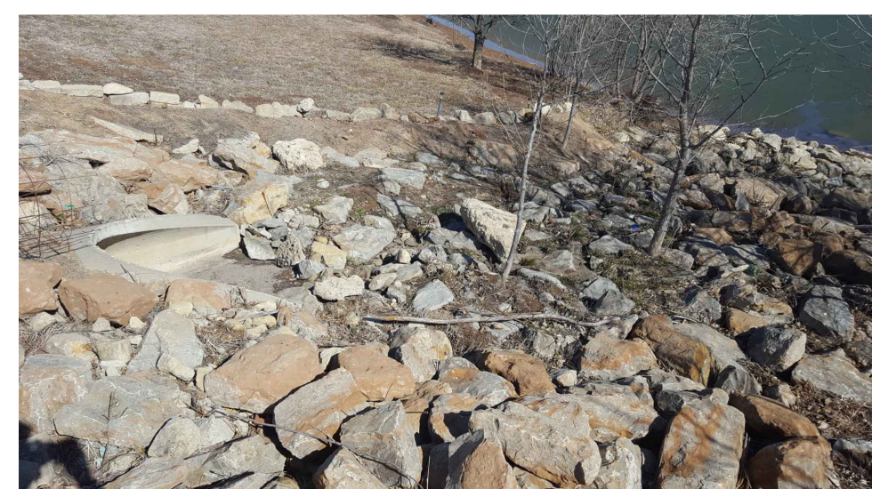
Figure B: Existing Rip-Rap below Flared End Section. Note the stone wall in the background.