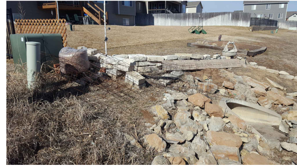
Figure A: Utility structures and landscape features to be protected. Note the stone wall extends toward the pond.