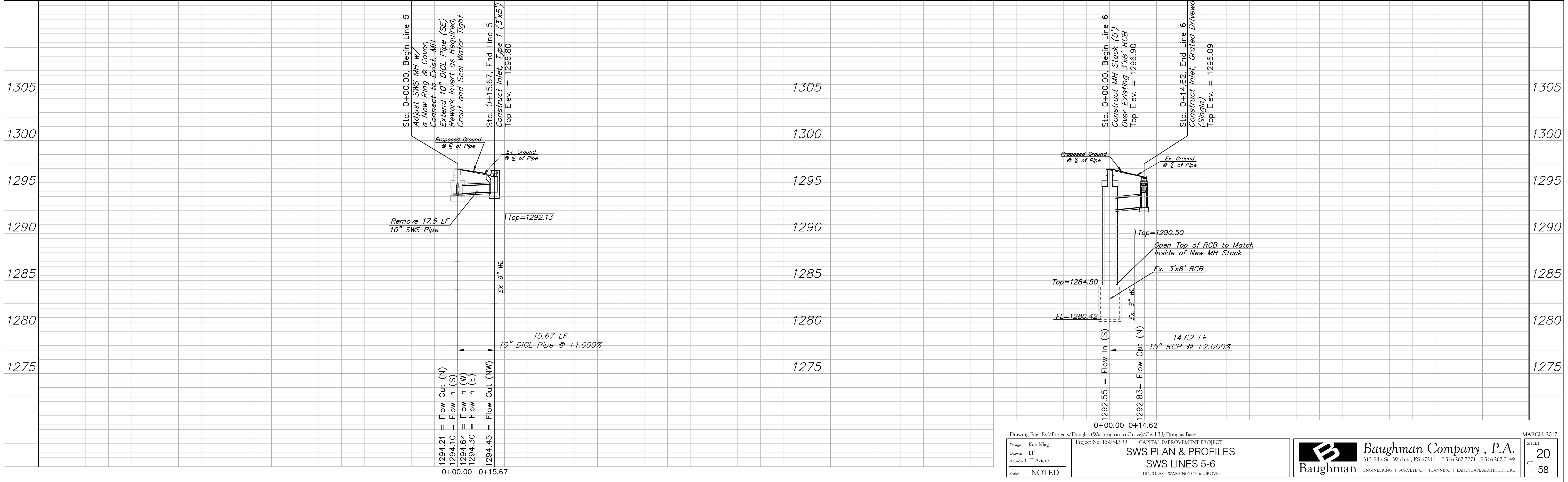
SWS Line 6