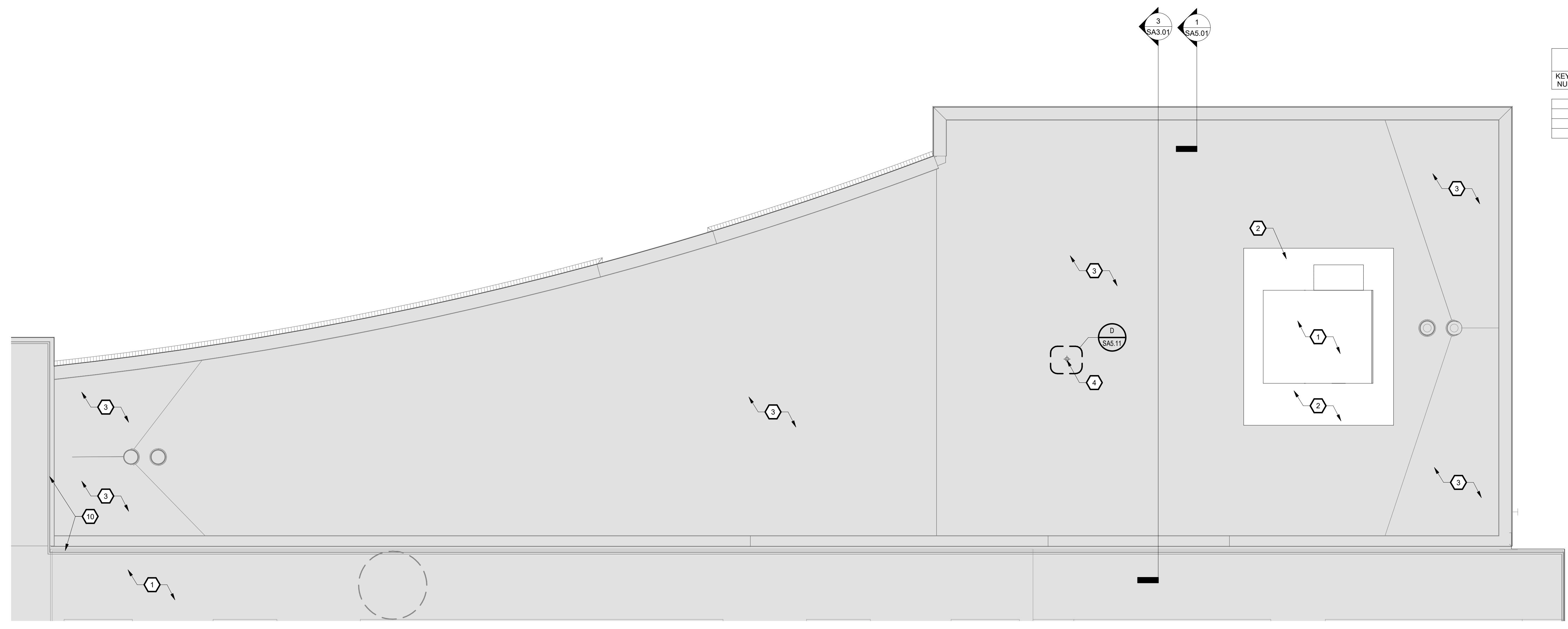
B NORTH LOCKER - ROOF PLAN 1/4" = 1'-0" 0 2 4 8 NORTH