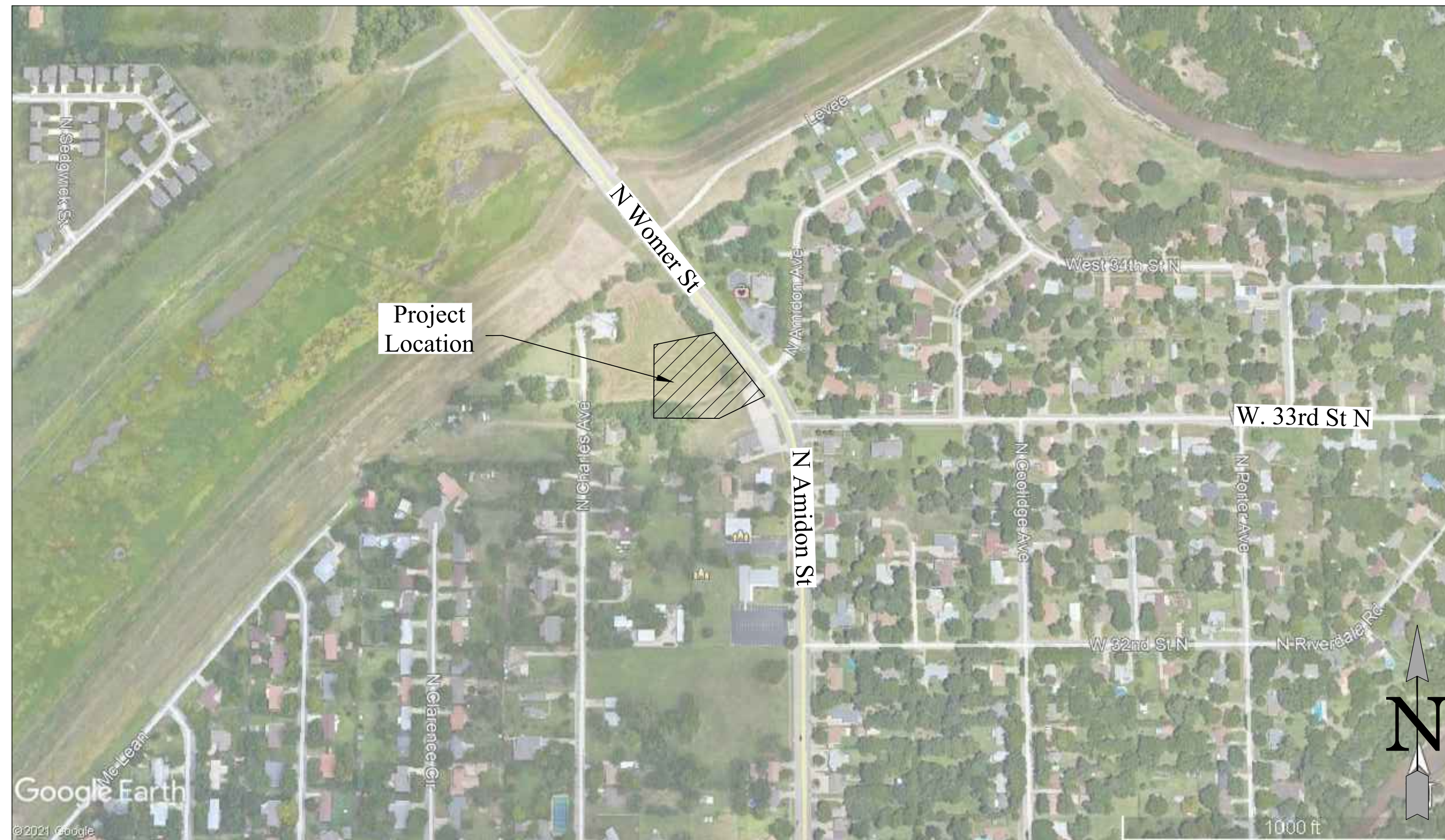
VICINITY MAP SECTION 03-T11S-R22E NOT TO SCALE

KANSAS ONE-CALL: 1-800-DIG-SAFE (1-800-344-7233)