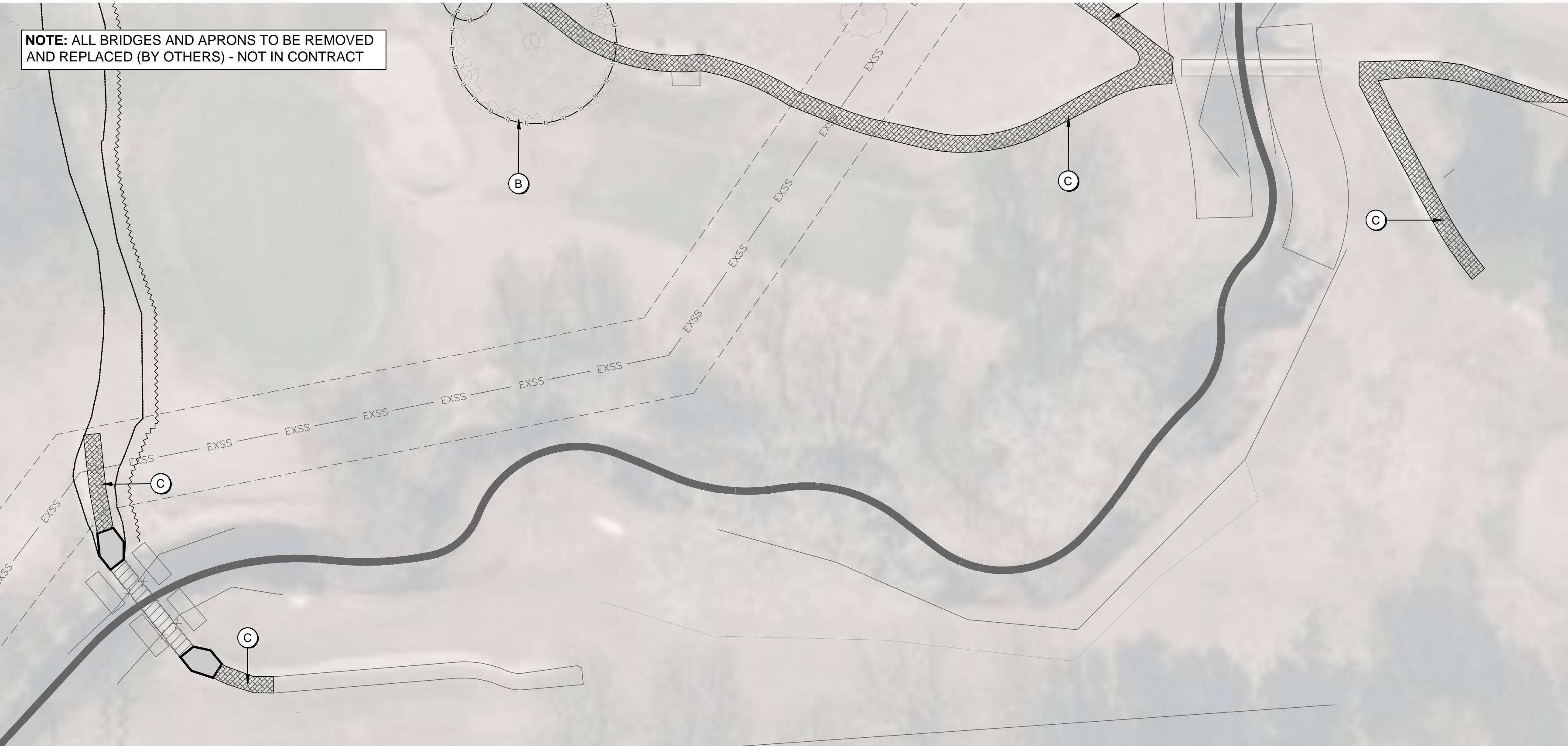
01 DEMOLITION PLAN ENLARGEMENT