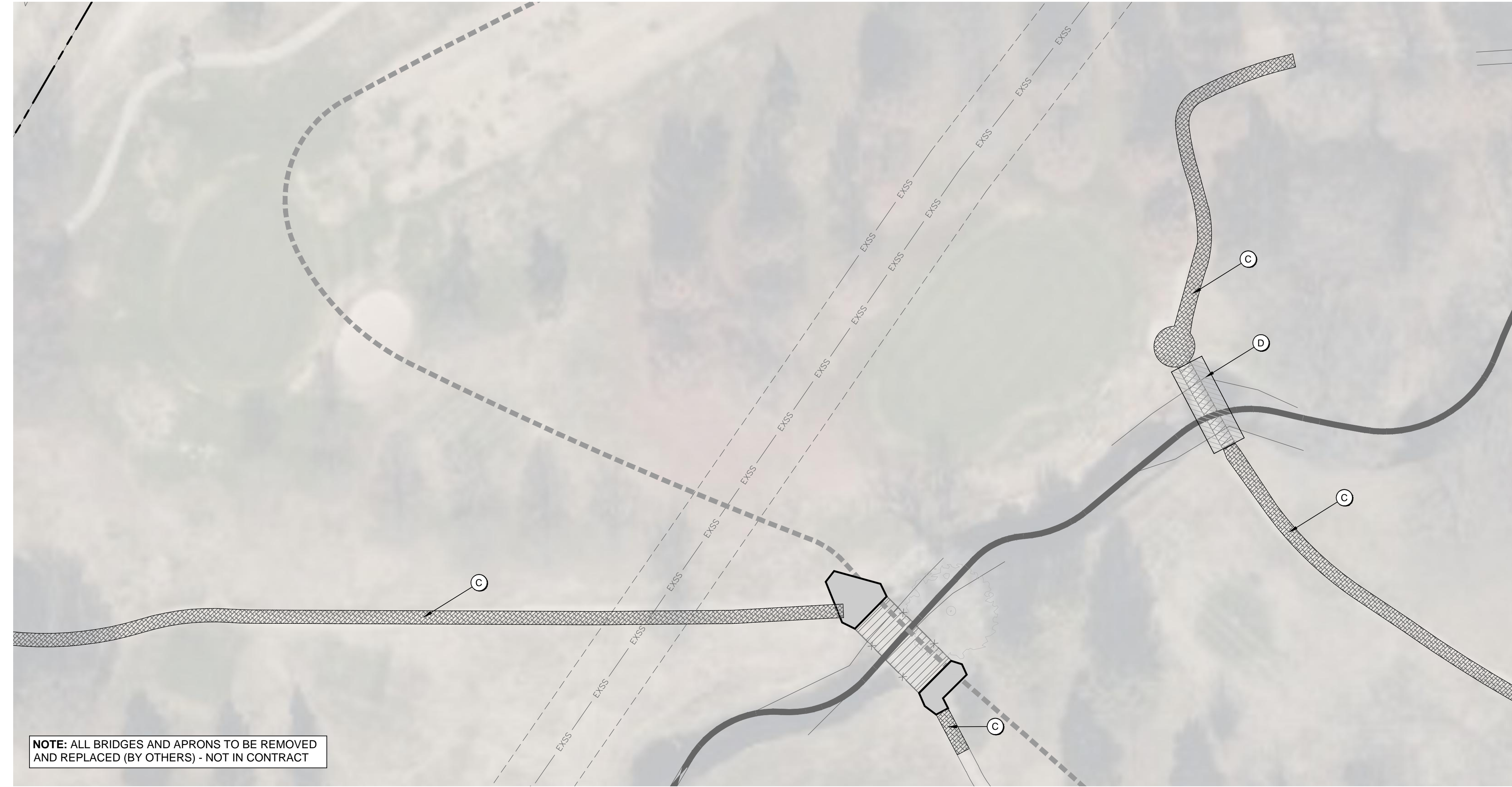
02 DEMOLITION PLAN ENLARGEMENT