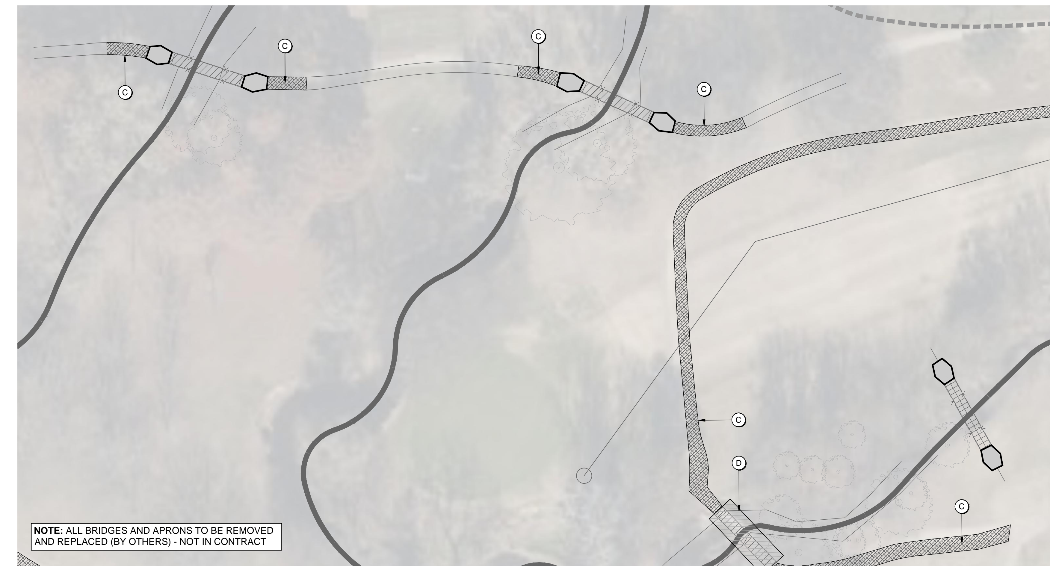
01 DEMOLITION PLAN ENLARGEMENT SCALE: 1"=30'