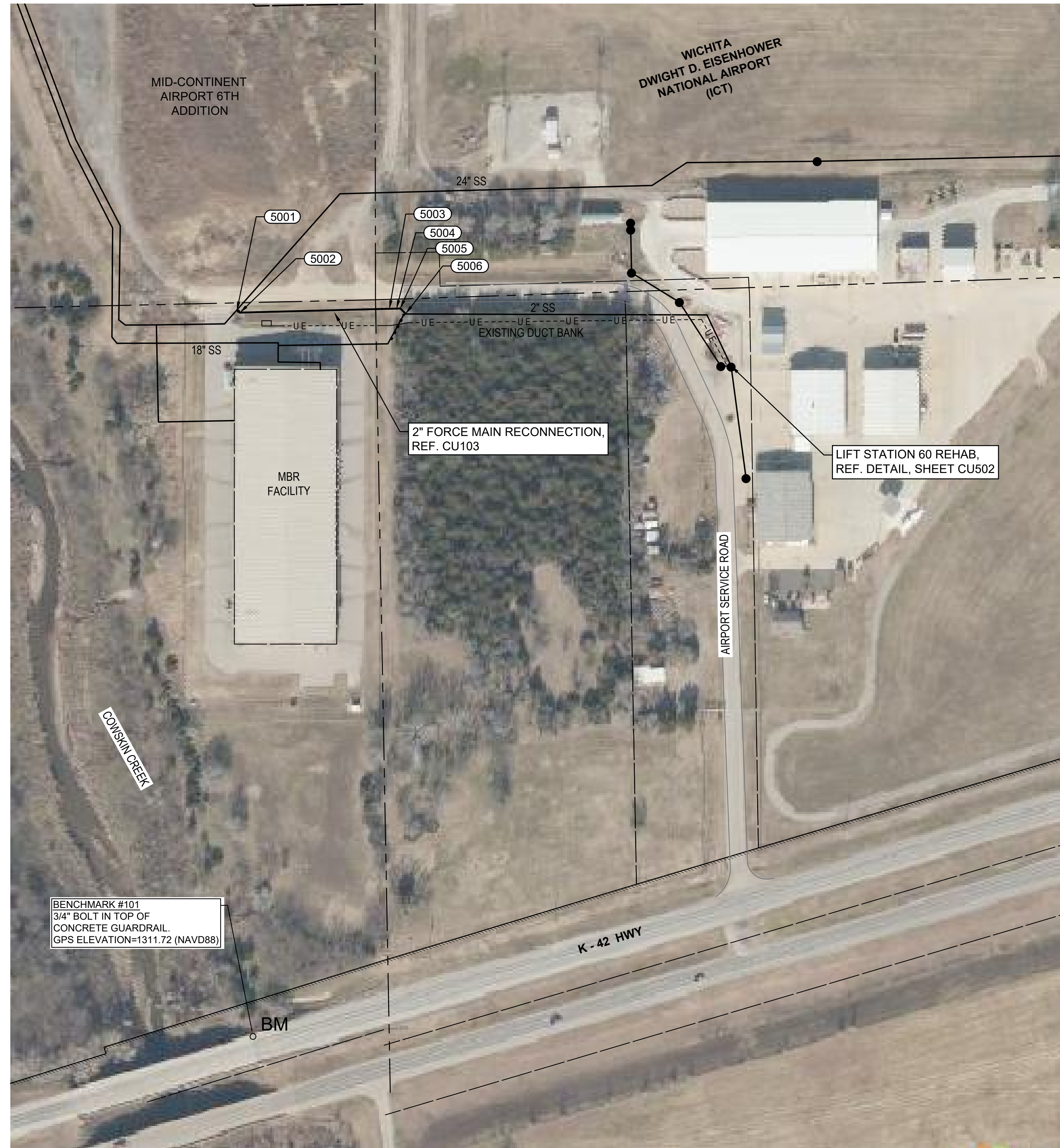
LIFT STATION 60 REHAB

SAVED 4/27/2023 10:21:29 AM BY KURTIS DEKAT PLOTTED 12/14/2023 9:38:52 AM BY CATHY LINK U:\WICHITA-CIVIL\2021\210602\001\MUNIDRAWINGS\AIR VALVE REPLACEMENTS\210602-001-CU102.DWG