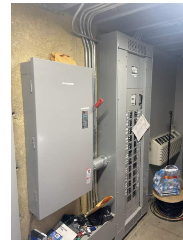
EXISTING PANEL MDP