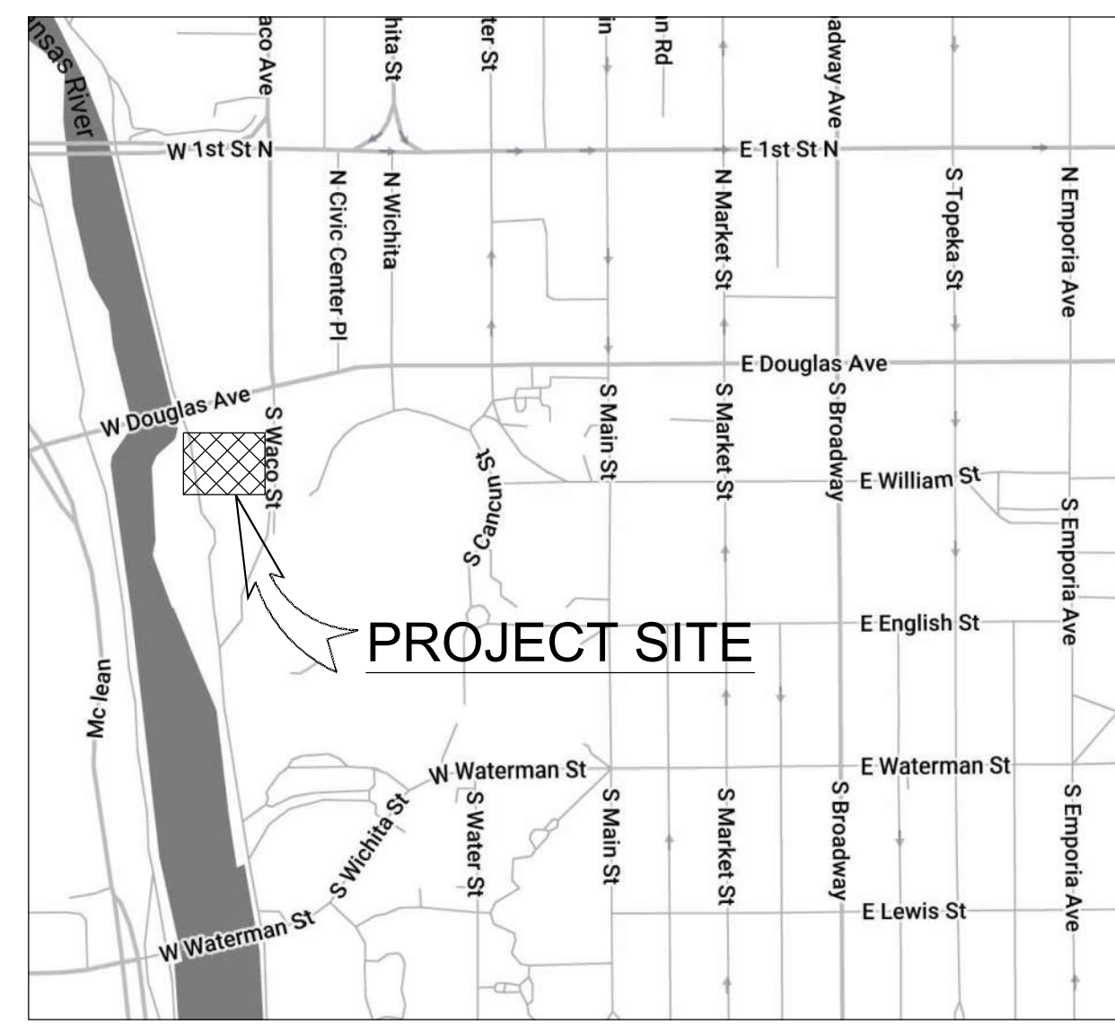
NO SCALE VICINITY MAP